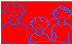
Improving Court Practice for Children and Families