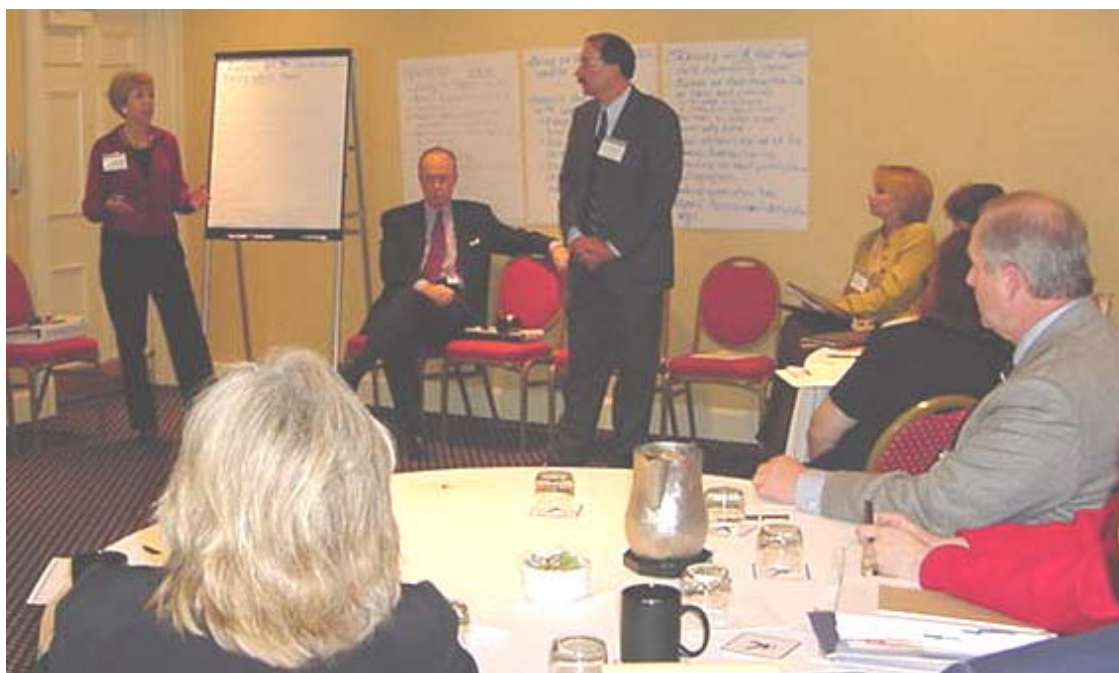
Best Practice Class of 2002 Convenes to Ask "Where Do We Go From Here"?

Watch for information in the near future regarding the planning of and expectations for these upcoming seminars.