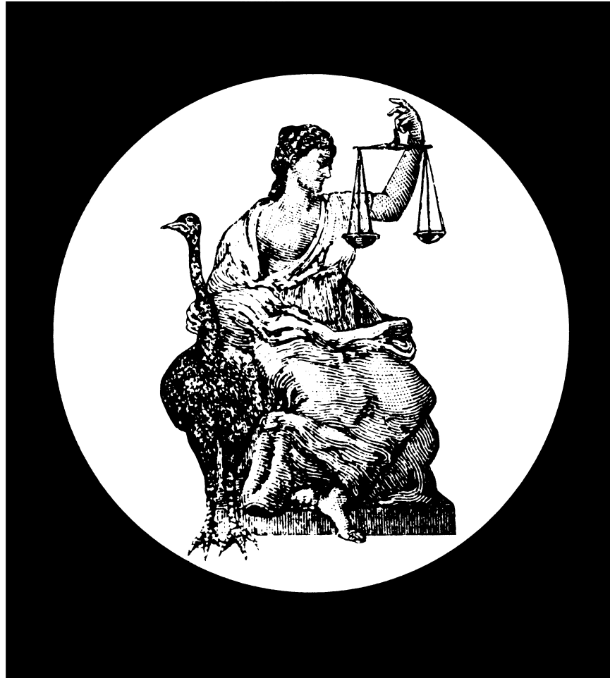
The Supreme Court of Virginia