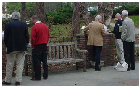
CLE attendees take their discussions outside during lunch at T.C. Williams Law School, University of Richmond.