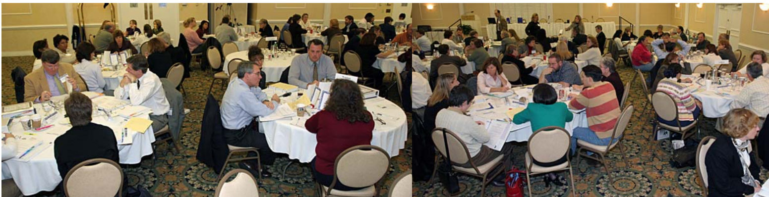
A bird’s-eye view of Best Practice Courts conferees sharing and learning together.